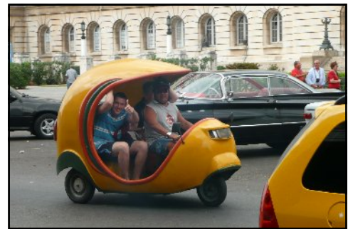
Happy with his taxi