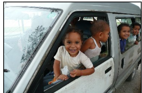
Kids loved to pose