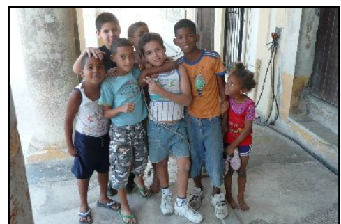
Kids happily playing

May '09 back in UK via Tonga/Mexico/Cuba Early May '09 back to UK until June July/August '09 in America for Laguna Seca and Indianapolis Moto GP Races.....then Sept/Oct to France for £29! And park Mercie in Spain