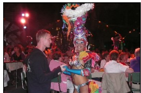
Our Russian friend with dancer

May'09 back in UK via Tonga/Mexico/Cuba Early May '09 back to UK until June July/August '09 in America for Laguna Seca and Indianapolis Moto GP Races.....then Sept/Oct to France for £29! And park Mercie in Spain