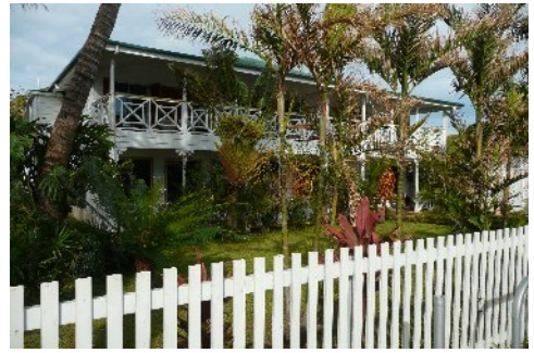
Waterfront Hotel Nuku'alofa

When I was 13 I remember Queen Salote of Tonga as being one of the most colourful guests at Queen Elizabeth's Coronation. It was so nice some 56 years later to visit my 59th country. Tonga is struggling following the riots of 2006 when many Chinese owned properties were burned out. It suited us to be here as a stopover and they need more visitors when the planned cruise ship terminal is completed. Do visit my Flickr site to view more and bigger photos.