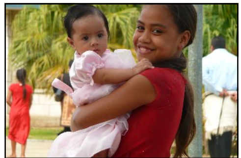
Friendly people go to Church

May'09 back in UK via Tonga/Mexico/Cuba Early May '09 back to UK until June July/August '09 in America for Laguna Seca and Indianapolis Moto GP Races.....then Sept/Oct to France for £29! And park Mercie in Spain