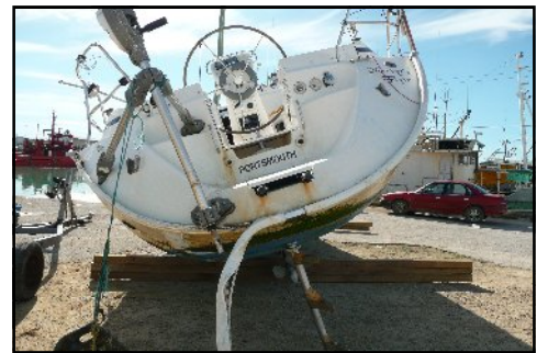
From Southampton UK