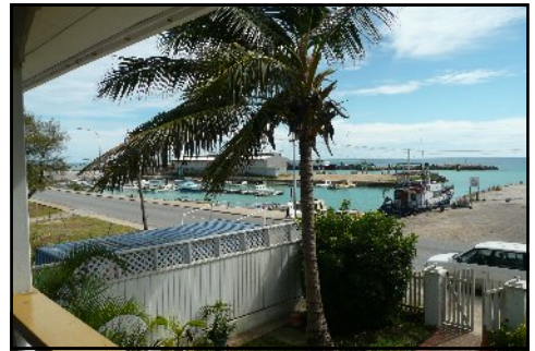
From our balcony, TONGA