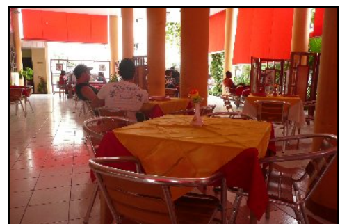
Another rip off.....

May '09 back in UK via Tonga/Mexico/Cuba Early May '09 back to UK until June July/August '09 in America for Laguna Seca and Indianapolis Moto GP Races.....then Sept/Oct to France for £29! And park Mercie in Spain