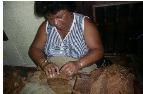
Once was a dusky maiden