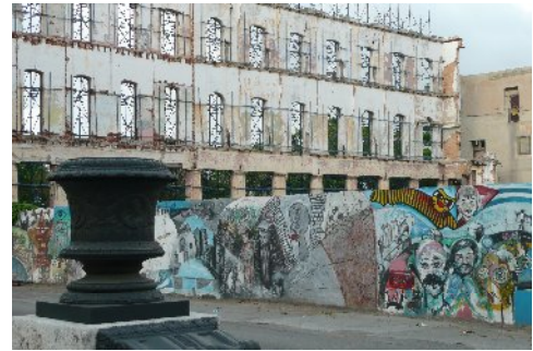
Facade to be saved