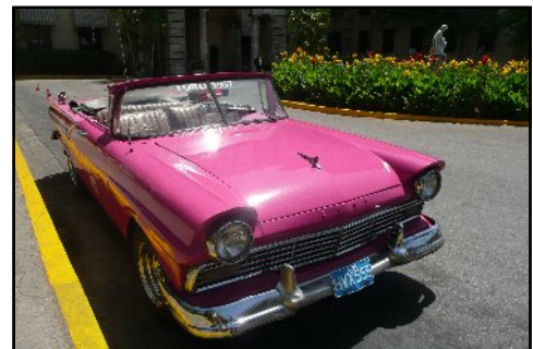
Quite a few convertibles