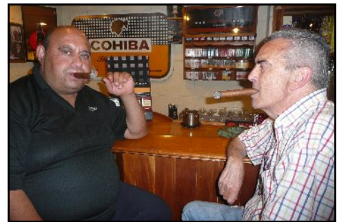
Enjoying the expensive