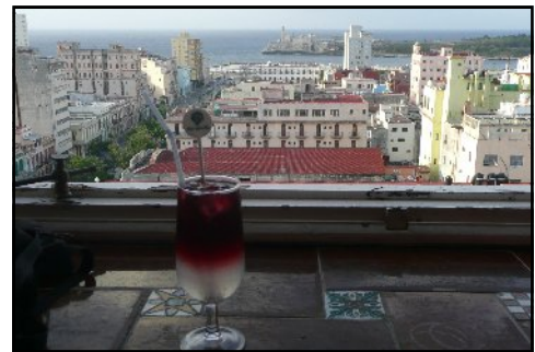
Hotel Sevilla to harbour