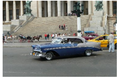
'50s US of A, Capital building

The poverty becomes very obvious and 45% of the population is living in uninhabitable property in Havana - but still there are many smiling faces even with so little. It's a third world country in so many respects and yet when you see the Capital Building this is world class standard. In short Cuba is a challenge to understand and it will change quickly, especially with Obama routing for change and Michelle buying Cuban fashion!