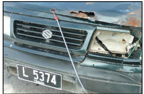
Cars are not pristine!