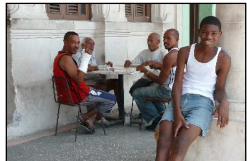
Sunday dominoes Malecon