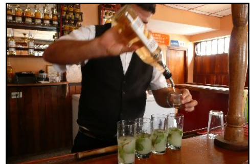
Mojitas - the sting