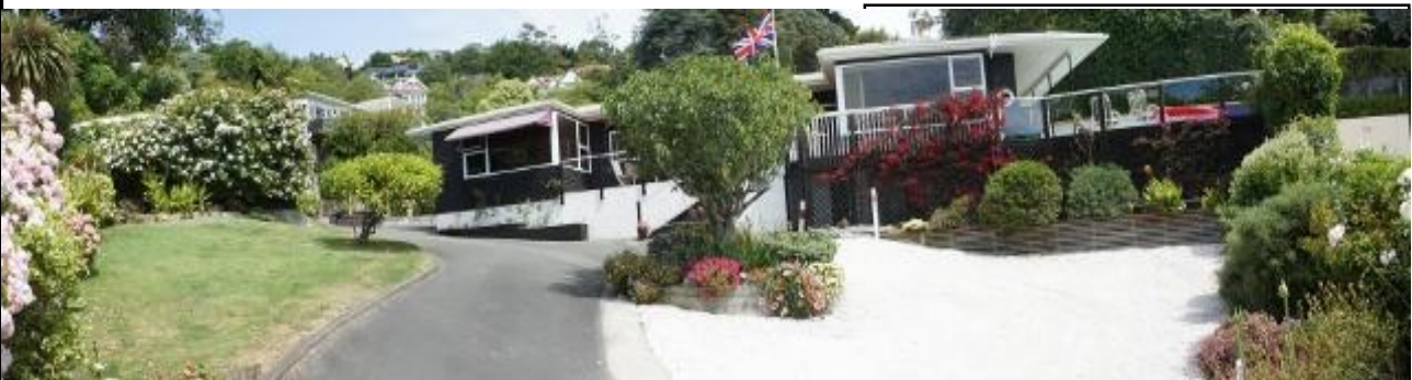
Colourful garden at The Cut Union Jack flying and Fingers crossed on the Ashes

We have friends arriving from Brisbane on Xmas eve, they are escaping tremendous rain storms there. We met our new neighbours Gary & Donna here in Nelson, they drink, garden and laugh so we have things in common. We plan on a sunny Christmas time and wish you all Merry Xmas and Happy 2011 .