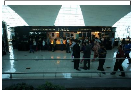
Parisienne taste at Dubai