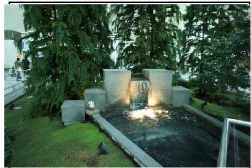
Tranquillity inside Dubai Airport