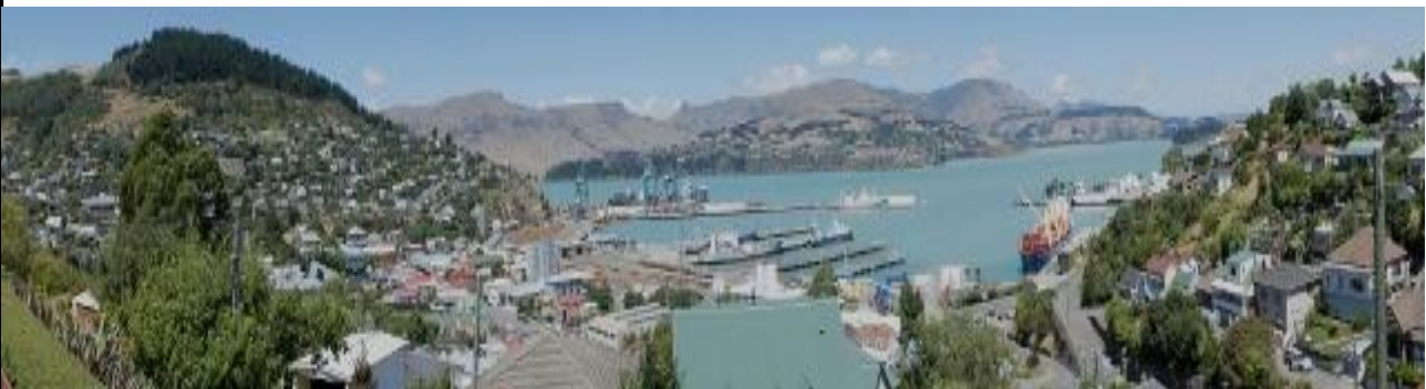
Lyttleton Harbour Busiest in South Island

New Zealand has the world's oldest driver at 105 and has four motorcycle license holders over 90 years old -with trips like this I hope to manage a few more years riding.