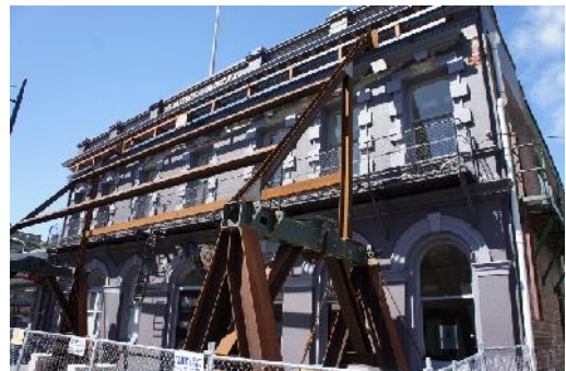
Empire Hotel Lyttleton