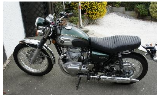
Kawasaki retro W800