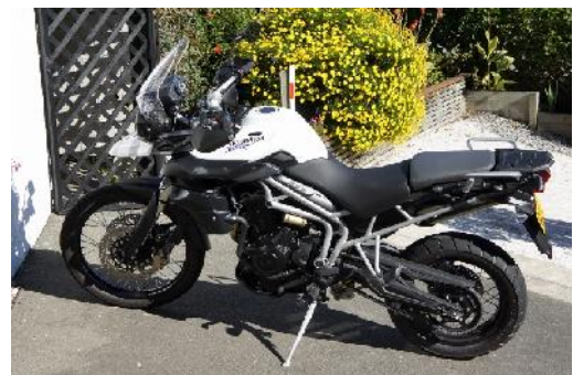
The new 3 cylinder Triumph