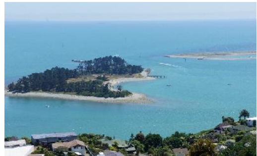
The Cut—entrance to harbour