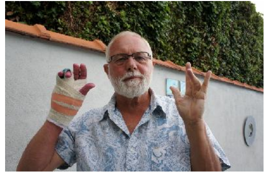
One hand done