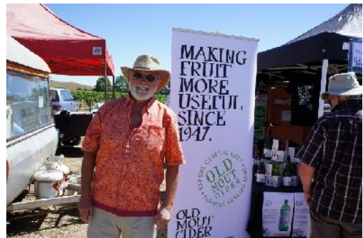
Cider sign on HOT day