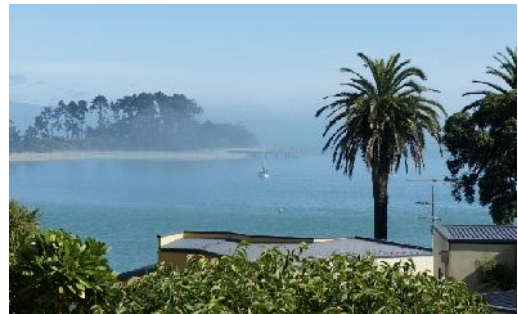
Mist lifting from the Cut