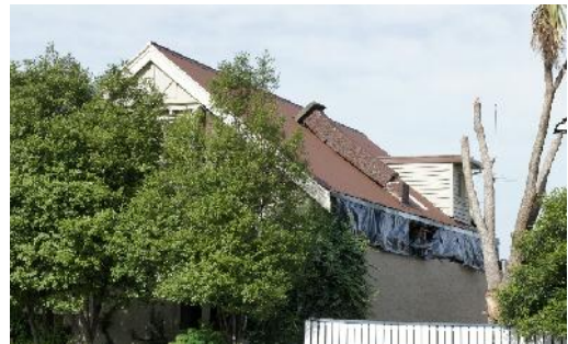
Chimney snapped—roof held!