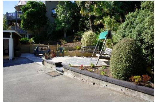
Garden upgrade coming on....

Our return journey starts Monday with stop-overs in Brisbane—Singapore—Dubai and Manchester before a bus ride gets us to our Yorkshire home and family.