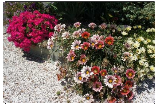
Colourful garden at The Cut