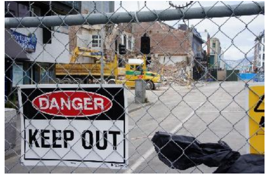
Manchester St Christchurch