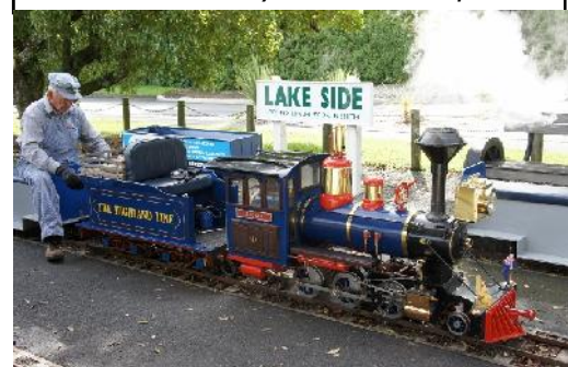
Easter Monday in Nelson NZ - So like Easter in the UK

return to UK on May 2nd collect Mercie in Spain late May, trip to Barcelona MGP in June, Mugello MGP Italy in July (meet Des Molloy) Sachsenring MGP Germany, back for summer in UK - Mercie serviced taxed etc. Greece/Turkey Sept/Oct. and store Mercie. Back to NZ for 2011/12.