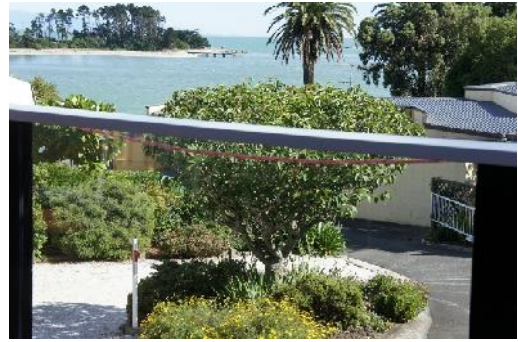
Glass balcony—note Xmas lights

Everything feels expensive here with the pound being low to the NZ $ but GST (sales tax) has increased and inflation seems noticeable—are we glad to be here with all the flowers growing rather than frozen BBrittain? - YOU BETCHA.