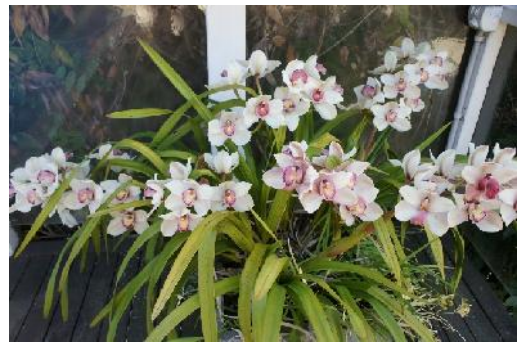
Orchids greeted our return