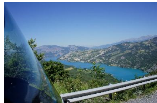
Italian border getting near

collect Mercie in Spain late May, trip to Catalunya MotoGP then Mugello MGP Italy in July (meet Des Molloy) Sachsenring Moto GP ,back for summer in UK - Mercie serviced taxed etc. Ride new bike! Maybe a trip to Greece/Turkey Sept/Oct.....back to NZ for 2011/12 via Kerala.