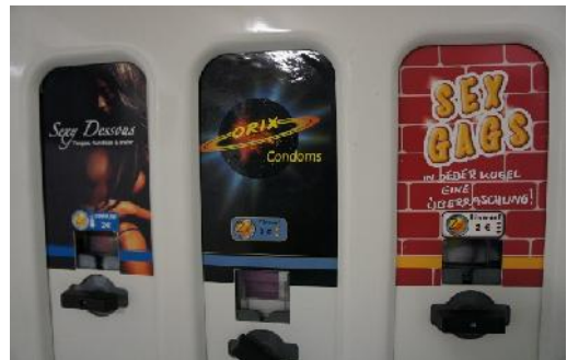
Camping KNAUS—many facilities