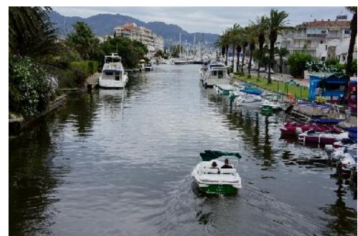
Rental boats are available - very pleasant way to be nosy!

collect Mercie in Spain late May, trip to Catalunya MotoGP then Mugello MGP Italy in July (meet Des Molloy) Sachsenring Moto GP ,back for summer in UK - Mercie serviced taxed etc. Ride new bike! Maybe a trip to Greece/Turkey Sept/Oct.....back to NZ for 2011/12