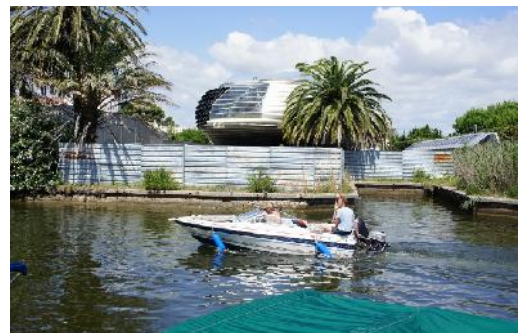
Is that a spaceship?