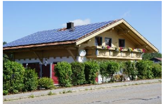
The scenery on houses & farms