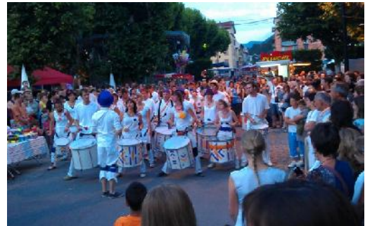
Digne les Bains