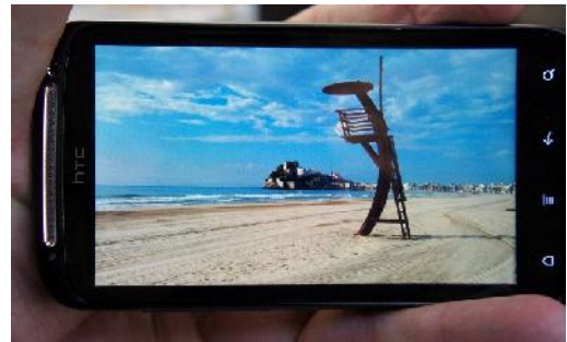
Shows screen on new phone

We hadn't caught her on the phone but she met us with a smile and punched the air as she said she was clear following the chemo. She hopes to get a hip replacement done now! - what an iron lady, it was a joy to take her to lunch and stay up to see her birthday in. We managed to see Barcelona beat Man U and were deafened by the celebration fireworks as we left the local club—they deserved to win. There was time for a birthday breakfast too before leaving.