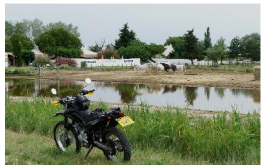
Lots of horses and Mossies in the Camargue

collect Mercie in Spain late May, trip to Catalunya MotoGP then Mugello MGP Italy in July (meet Des Molloy) Sachsenring Moto GP ,back for summer in UK - Mercie serviced taxed etc. Ride new bike! Maybe a trip to Greece/Turkey Sept/Oct.....back to NZ for 2011/12