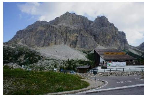
Nearing Austrian border Cortina

collect Mercie in Spain late May, trip to Catalunya MotoGP then Mugello MGP Italy in July (meet Des Molloy) Sachsenring Moto GP ,back for summer in UK - Mercie serviced taxed etc. Ride new bike! Maybe a trip to Greece/Turkey Sept/Oct.....back to NZ for 2011/12 via Kerala.