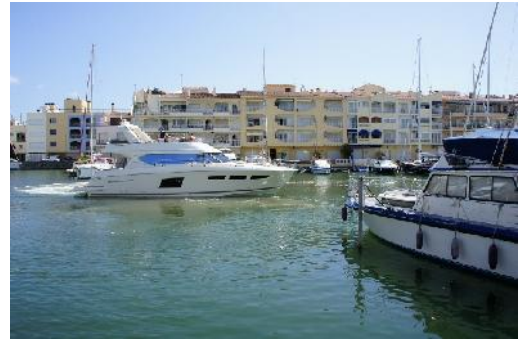
Empuria Brava, Spain

The D81 took us North up the coast where we twisted and turned as we approached Portbou, it was hard driving but spectacular—then we were into France. It's surprising how quickly things change and it was very busy everywhere. Our first campsite choice at Argeles de Mer was full—apparently the first time in 10 years due to it being holiday time in Spain/France/Germany. It did us a favour as we are at Le Florida at Elne which we highly recommend. We had passed through heavy showers but late afternoon it was sunny and 28C and were able to have dinner and breakfast outdoors. Boules/Tennis/Swimming and even an outdoor stage for sizeable concerts plus free wifi which worked superbly. We can get internet radio playing through the hifi so BBC Radio 4 has kept us up to date on the latest Christchurch quake.