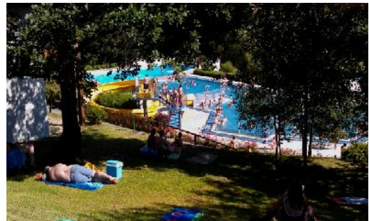
Viechtach's outdoor pool was Crowded on this hot day

Next Sachsenring Moto GP ,back for summer in UK - Mercie serviced taxed etc. Ride new Tiger 800! Maybe a trip to Greece/Turkey Sept/Oct.....back to NZ for 2011/12 via Kerala in SW India where we hope to ride a mountain railway and rent a motorcycle.