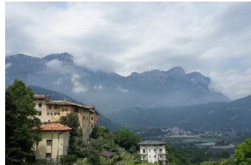
Very impressive Dolomites