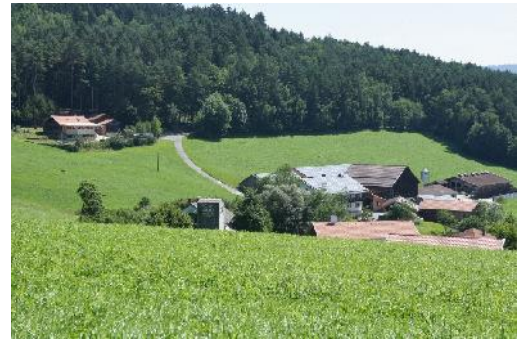
Solar panels are changing