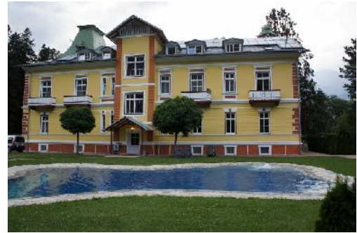
1st Austrian campsite, Amlach

The S49 brought us into Austria and our plan is to use scenic 158/151/143 maybe a bit of A8 which will take us into Germany near Passau which is also close to the Czech border. This will mean that we will have had good value from the vignette for Austrian roads the charge of 7.90 Euros covers vehicles up to 3.5 tonnes which just covers Mercie. Diesel was a bit cheaper than Italy at about 1.35 per litre. Mercie has been fuel efficient even coming over the many mountain passes but we do plan not to drive more than necessary to see what we want to see—