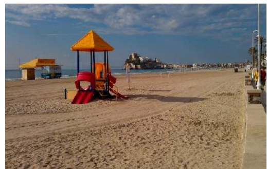
Peniscola—taken by new HTC Sensation phone

Our next overnight was Javea where there is a great sports bar to watch the F1 (shame that Vettel was so lucky) and onwards to Peniscola where we are staying 3 nights before driving to Barcelona to collect our tickets for the Catalunyan MotoGP which is this weekend. This means we have travelled about 900km so far. We like Peniscola with terrific esplanade, excellent Camping Eden campsite and pool, good local shops and a bar with free wifi so I can fiddle with the new technology, it is a challenge for the aging brain.