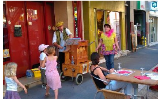
Barrel organ with young dancers

A trip to Intermarche worked well so we and Mercie were fuelled for Italy. The D900 was fantastic driving and changed to the S21 at the border, literally hundreds of motorcycles were out but it did get a bit busy after Sunday lunch when they were back on the road. Just across the border were the very different Italian voices but when we arrived at our chosen campsite Il Melo a little South and past Cuneo. It was another good choice and we saw ACSI people vetting the site's standards. You should have had a bathing cap and close fitting trunks—I can only surmise that the powerful pool chemicals would shed my body hair! - but what about my beard?