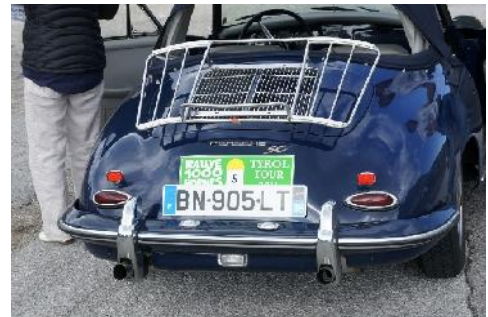
Lucky to see car rally