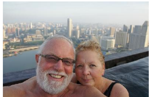
Birthday treat goes on...