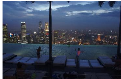
Singapore 57th floor