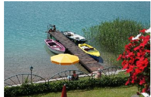
Lake at St Wolfgang