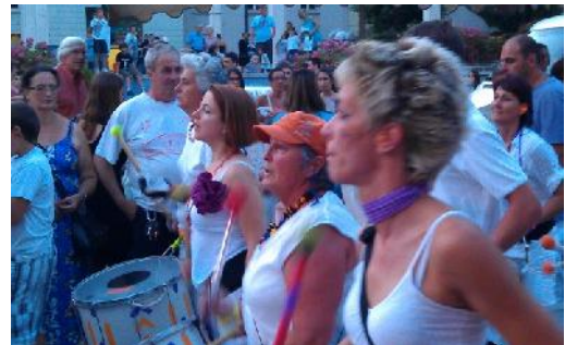
Wonderful and compelling