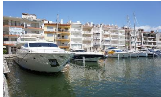
Boats and canals everywhere