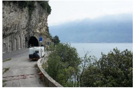
Mercie into tight dark tunnel

Our friends Robin & Norrie had travelled to Bad Waldsee in Germany to have Hymer do some work on their van—text messages are wonderful and we will meet up in a few days as we all head for the next Moto GP at the Sachsenring .