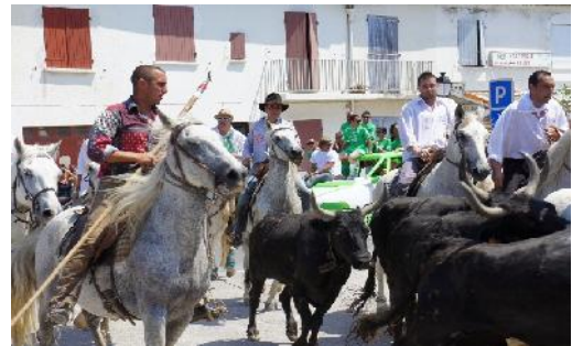
Bulls arrive Saintes Marie