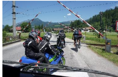
Bikers & cyclists as barriers open