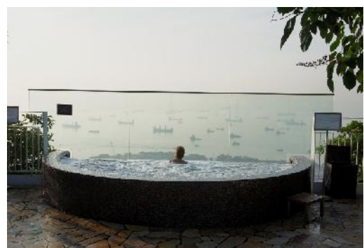
Marina Bay Sands Casino Hotel Di inspects the shipping

to UK in May 2011 collect Mercie in Spain late May, trip to Catalunya MotoGP then Mugello MGP Italy in June (meet Des Molloy) Sachsenring Moto GP ,back for summer in UK - Mercie serviced taxed etc. Maybe a trip to Greece/Turkey Sept/Oct.....back to NZ ?via Philippines for 2012