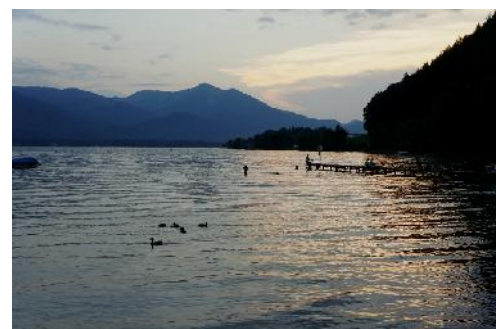
Sunset taken from our Pitch at Camping Berau

Next Sachsenring Moto GP, back for summer in UK - Mercie serviced taxed etc. Ride new Tiger 800! Maybe a trip to Greece/Turkey Sept/Oct.....back to NZ for 2011/12 via Kerala in SW India where we hope to ride a mountain railway and rent a motorcycle.